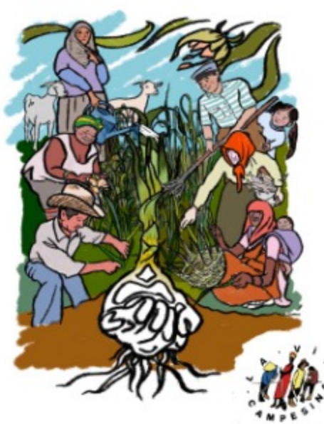
UNITED NATIONS DECLARATION ON THE RIGHTS OF PEASANTS AND OTHER PEOPLE WORKING IN RURAL AREAS - Book of Illustrations -

Through compelling visuals that were carefully crafted by Sophie Hollin, this book aims to popularise the contents of the UN Declaration and spread awareness about it among rural communities. The book, originally produced in English, Spanish and French, will also be available as an open-source document for social movements to adapt and translate into local languages.