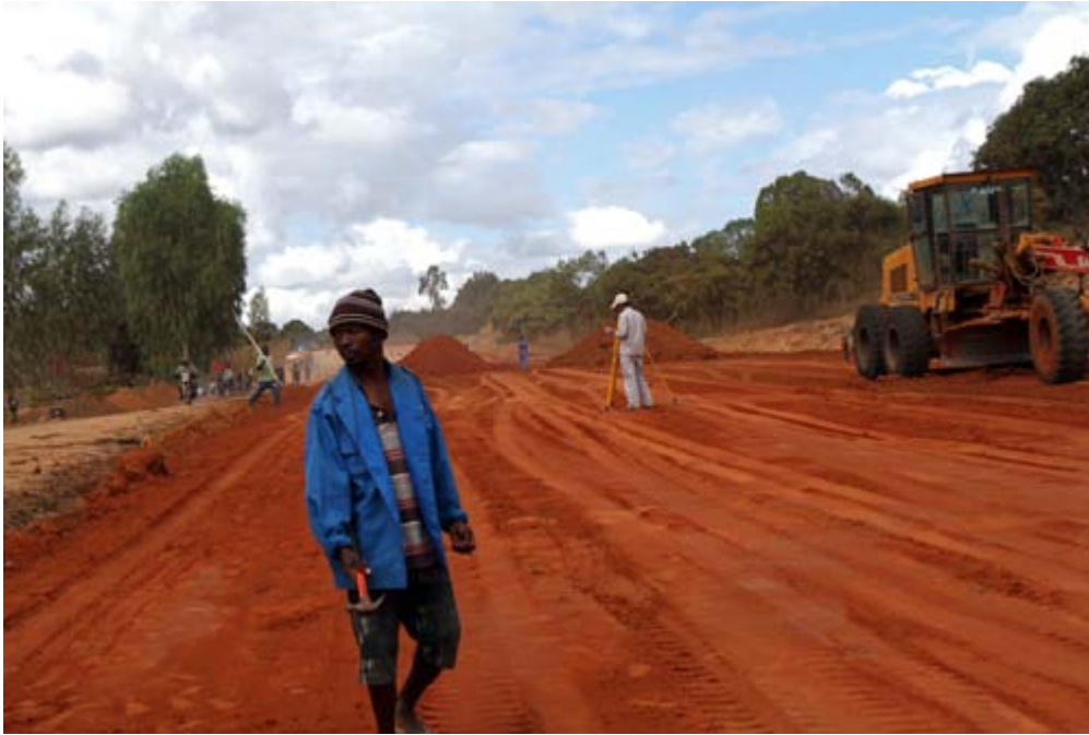
Construction of infrastructure to support large-scale agriculture is under way throughout the Nacala Corridor.

the largest cotton company in the country. The majority owner of Mozaco, however, is Rioforte Investments, with 60% of the company's shares. 11