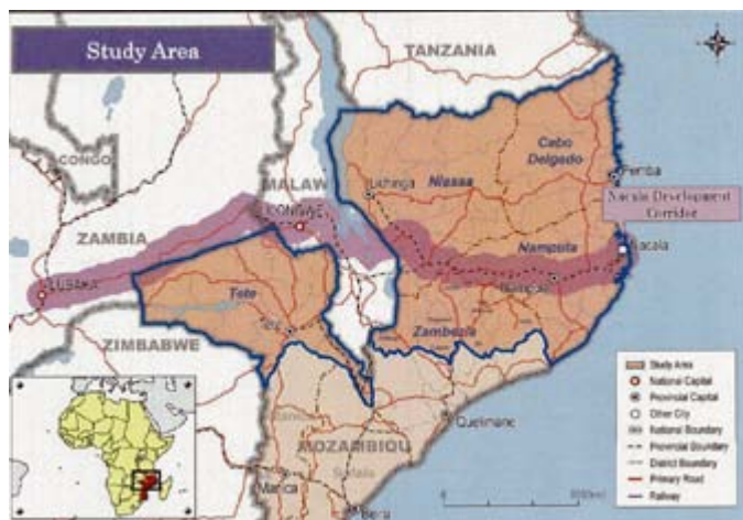
Image from PEDEC (Project for Economic Development Strategies for the Nacala Corridor), 2014.

The governments, companies and agencies promoting ProSavana and the other projects in the Nacala Corridor maintain that local farmers will benefit from in the new investment, infrastructure and access to markets. They also say that peasants will not be displaced from their lands to make way for corporate farms.