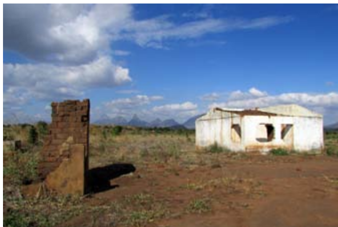
Abandoned house belonging to a family resettled by Mozaco.