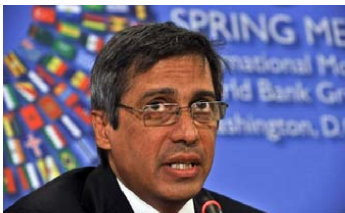
The Mauritian Minister of Finance, Charles Gaëtan Xavier Luc Duval.

In 2009, the Government of Mauritius established the Regional Development Company Ltd (RDC) to carry out investments in Mozambique, particularly in food production.