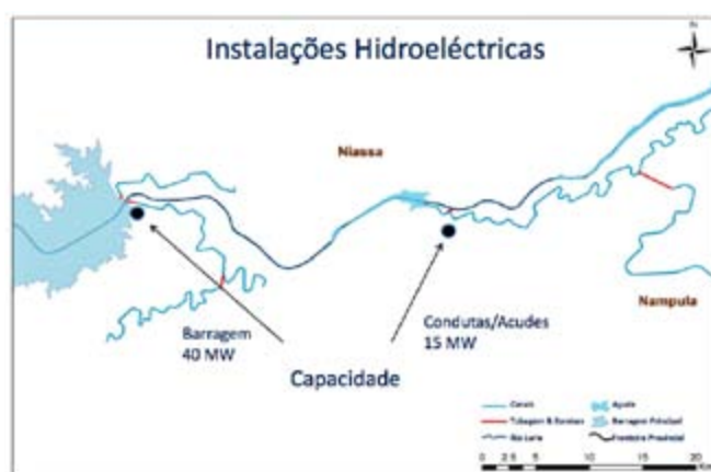
Slide adapted from a presentation made by Companhia de Desenvolvimento do Vale do Rio Lurio in January 2014.

PNISA was supposed to address the priorities of Mozambicans by putting the country's recently formulated Strategy Plan for the Development of the Agricultural Sector (PEDSA) into practice. But through the New Alliance's Framework Agreement, PNISA has been shaped to mainly address the interests of the major global powers, especially the G8 countries and their respective corporations, under the guise of enhancing Mozambique's "food and nutrition security". 4